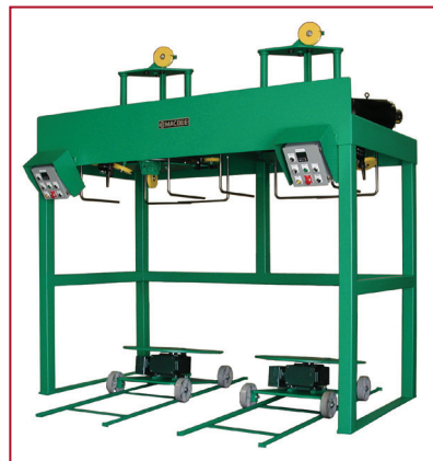
V-Groove Dead Block Takeup