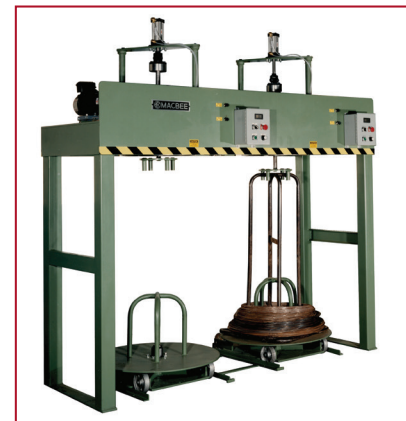
Live Block Takeup