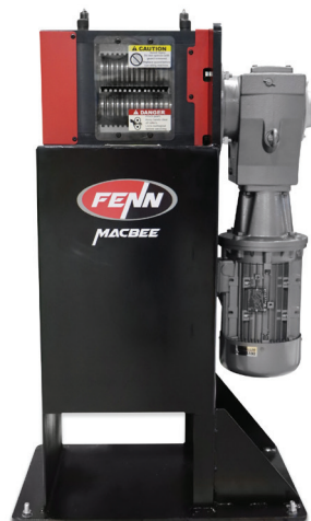
'C' Series Motorized 2 Roll Pointer