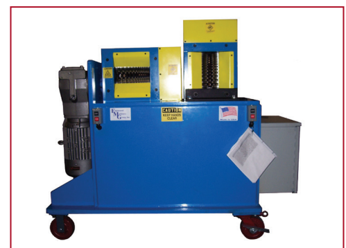
'D' Series Motorized 4 Roll Pointer