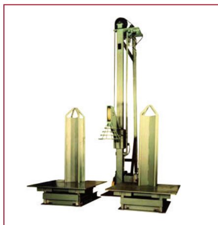
Overhead Payoff with Coil Upenders