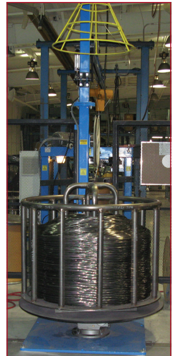
Overhead Payoff with Turntable