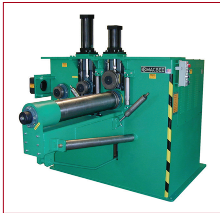
Horizontal Rod Payoff